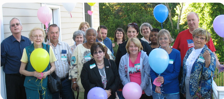
On the final day of group, participants write messages to loved ones and release a balloon.

Registration is required and a mandatory intake meeting must be completed two weeks prior to group beginning.