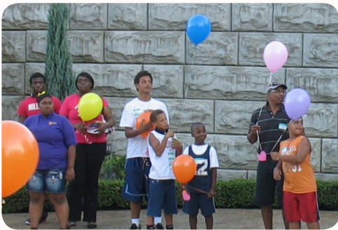
On the final day of group, participants write messages to loved ones and release a balloon.

This group is specifically designed for families that are grieving the loss of a loved one. Groups are divided by age, and Art Therapists and licensed Grief Counselors use art projects, games, stories and discussion to help you along your grief journey.