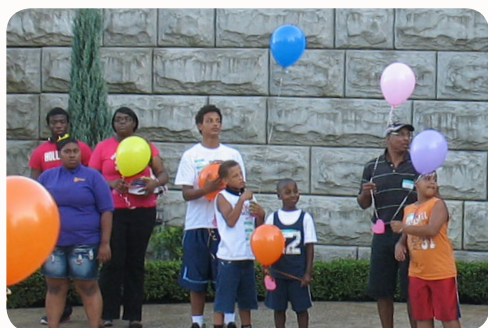
On the final day of group, participants write messages to loved ones and release a balloon.

This group is specifically designed for families that are grieving the loss of a loved one. Groups are divided by age, and Art Therapists and licensed Grief Counselors use art projects, games, stories and discussion to help you along your grief journey.