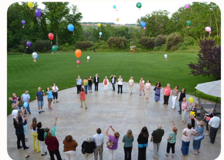
On the final day of group, participants write messages to loved ones and release a balloon.

Led by professionally trained and experienced facilitators. Session is ten weeks in length and each meeting is 2 hours. Provided at no charge to you, and includes a light dinner.